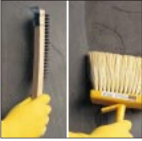
STEPS 1 & 2