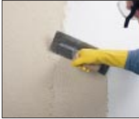
STEPS 1 & 2