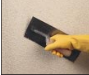
STEPS 3 & 4